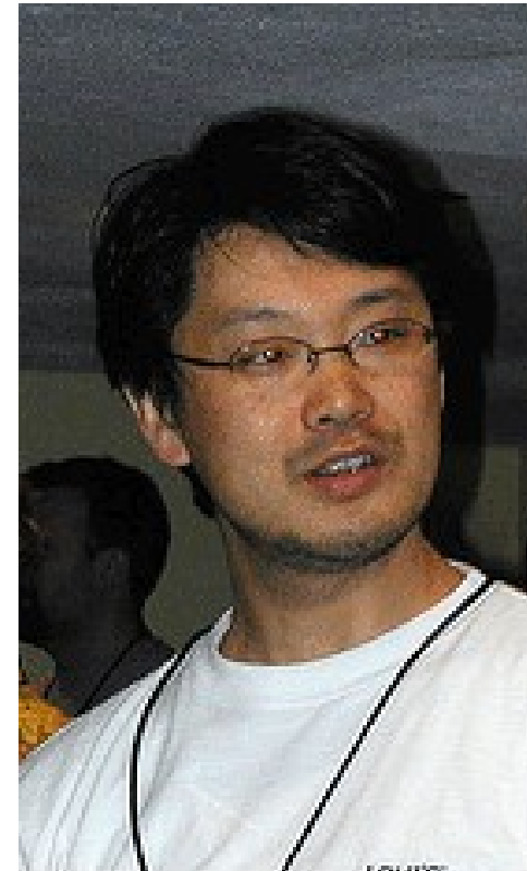
Ruby's architect, Yukihiro Matsumoto